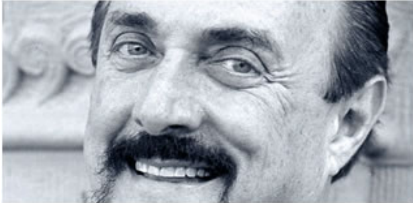
Professor Philip Zimbardo

You may remember the experiment had to be called off less than a week into the experiment due to the cruelty of the guards and resulting mental instability of the prisoners.