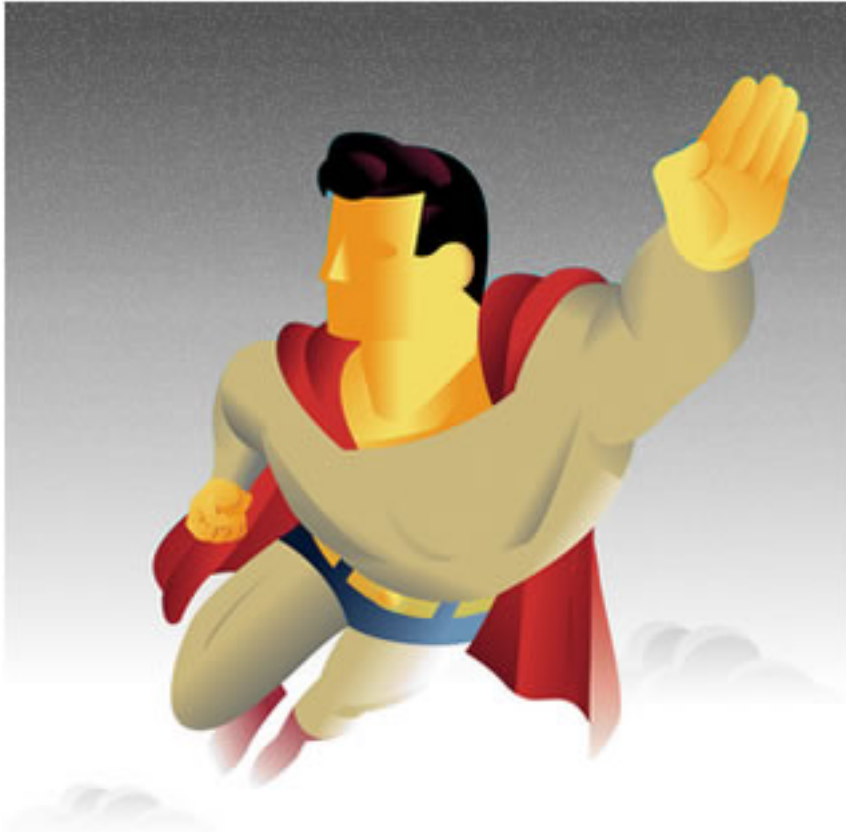
Heroism is the Antidote to Evil

One of the most dramatic findings in bullying research is the focus on the bystander as an effective intervention strategy to reduce bullying. On those rare occasions when a witness does object to bullying, there is a good chance that the bullying will stop. In fact, researchers have reported that bystander objections effectively discourage bullying at least half the time.