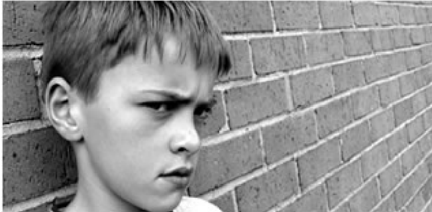
Bullying in schools is one of the most prevalent problems facing schools today.