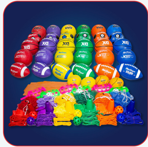
Replenishment Equipment Pack

Add a combination lock for security and leave the cart on the playground between recesses so that equipment is always available.