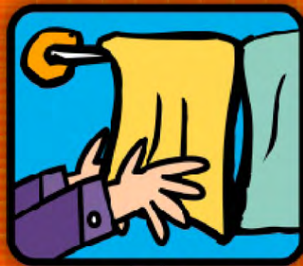
Dry your hands