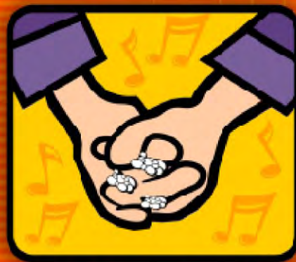
Rub hands together