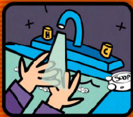
Rinse your hands