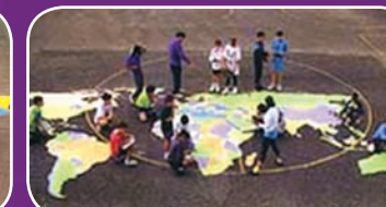
Area coverage: 36' x 18'

Encourages educational classroom projects in History and Geography!