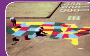
Area coverage: 16' x 27'

Quick and easy to use stencils allow you to transform your blacktop into a geographical playground in as little as 4 hours.